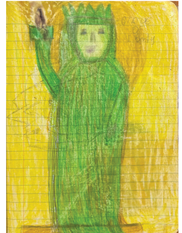
Drawing by Honesty