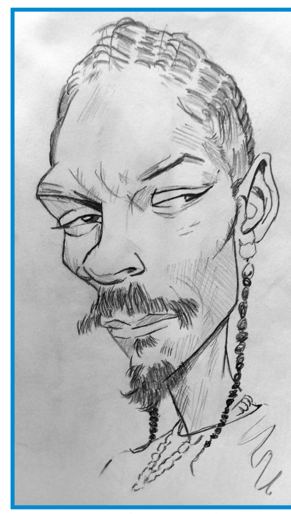
Drawing by Khari