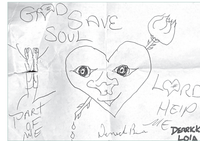
Drawing by Derrick