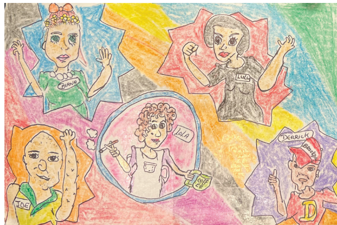
Drawing by Lola

IM FIXING THE BANKS COOLING SYSTEMS IM DUSTED FROM THE BASEMENT I GOTTA GET RELIGIOUS I FEEL A MIRACLE IN THE WIND THE GRAVE THE SECOND DEATH THE JUDGE GAVE ME HALF A SENTENCE IM IN A CYBER TRUCK ON THE APPLE PHONE THE QUEEN COOKING COLOGNE CASH IS KING THE MONEY REALLY MADE TO SEE IF WE CHANGE FACEIM IN SUPREME EXTRAVAGANT TO THE EXTREME I DID THE MATH WITH THE MILLIONS MULTI TASKING LAP TOPS AND NOTE BOOKS BY APPLE IN THE BAG ROLLING UP THE STREET ON A JOURNEY THE MONEY IM GETTING PAID GOT ME STEPPING UP THE PACE