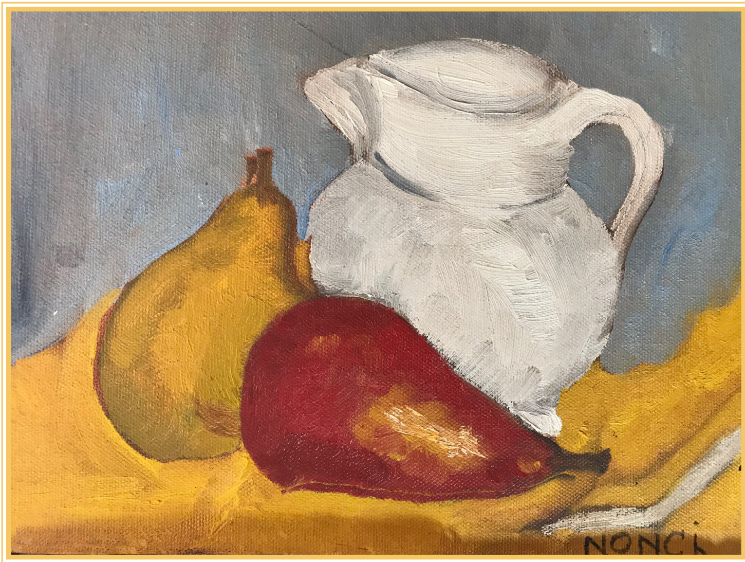
Painting by from Pierre-Antoine Nonci