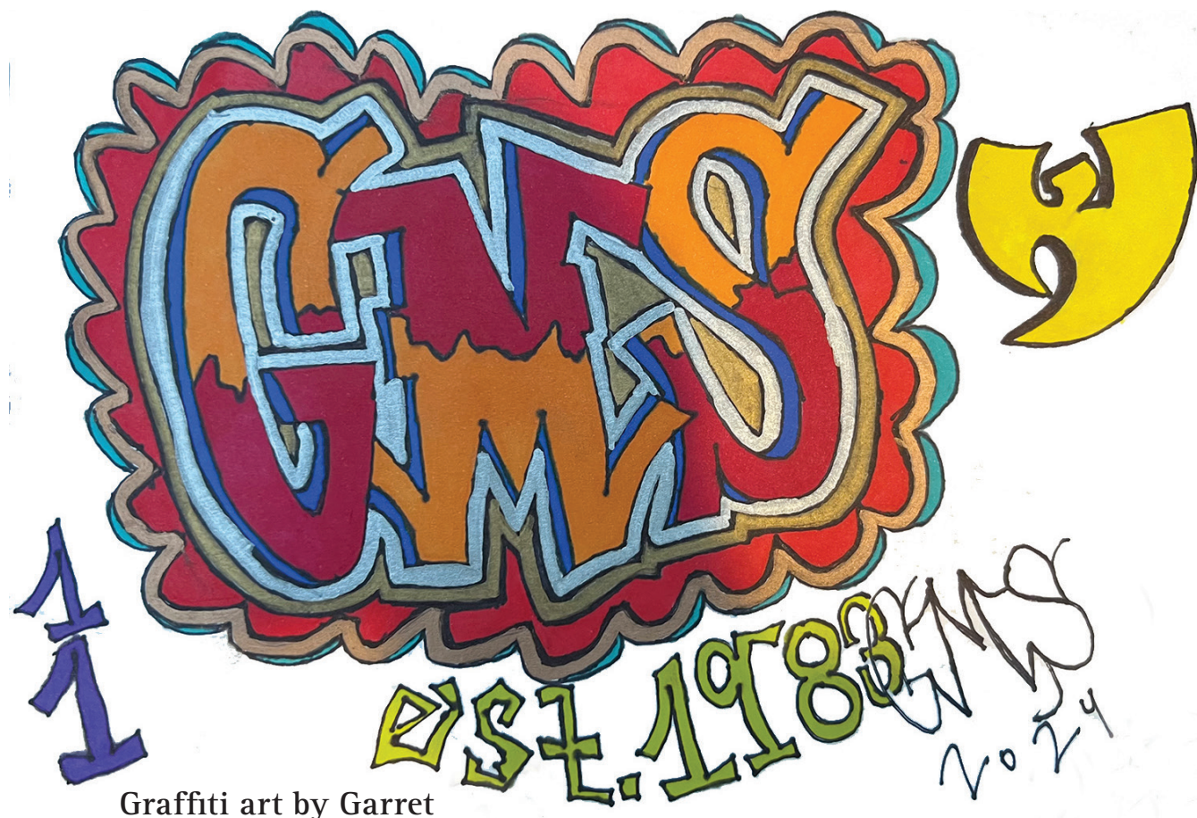
Graffiti art by Garret